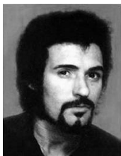
Peter Sutcliffe (The Yorkshire ripper)