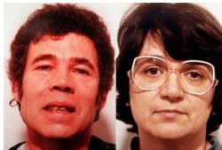
Fred and Rose West