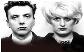
Ian Brady and Myra Hindley